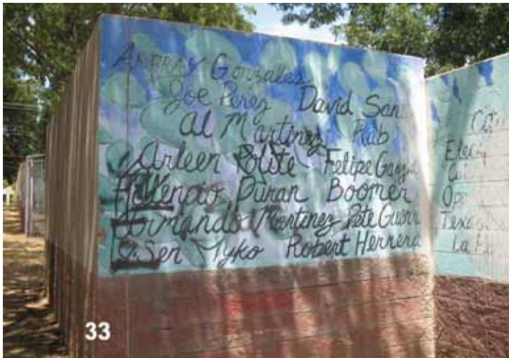
Signatures of commissioned artists.