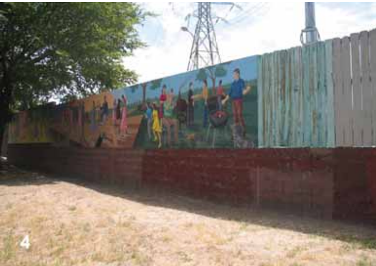
"La Quinceanera" by Fidencio Duran (AIPP) KEEP