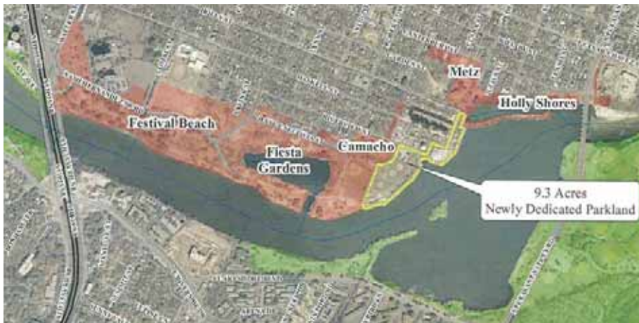
Holly Shores Master Plan area: existing parkland highlighted in red, newly dedicated parkland outlined in yellow.

We will gather with artists who are from, or have worked in and around, the Holly neighborhood, to talk about how the visual arts currently serve Austin's East Side neighborhoods. Join this team of Designers to explore the site together and give your input.