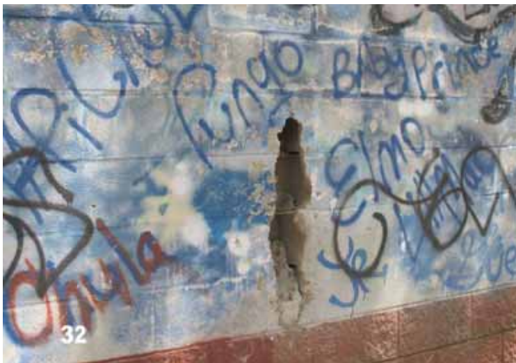
Structural damage; not commissioned.