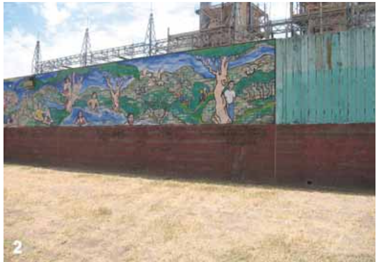
Untitled by Arlene Polite (AIPP)