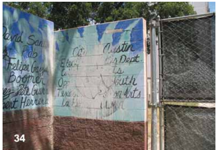
Signatures of commissioned artists.