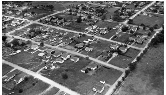
East Avenue and 38 ½ Street in 1950.