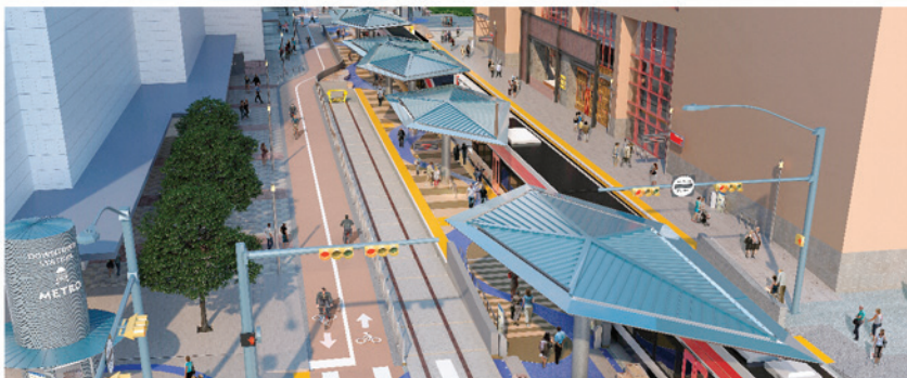
Capital Metro Downtown Rail Station Rendering