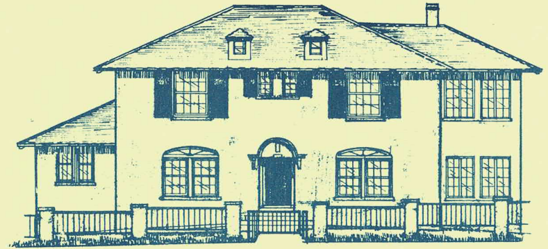
J. W. SCARBROUGH, SR. HOUSE 1801 West Avenue Owners - Earl and Jo Sue Howard

The house has had few major changes. A second bathroom was added upstairs, and a cook's quarters was attached behind the kitchen. The original brass furnace grates are still in place, but gas now fuels the furnace instead of coal. Highlights of the house are rich paneling, leaded glass front door and side lights, the entry area with shutters, fireplace, and window seats, and stained glass windows over the built-in buffet in the dining room.